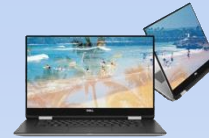
Dell XPS 2-in-1